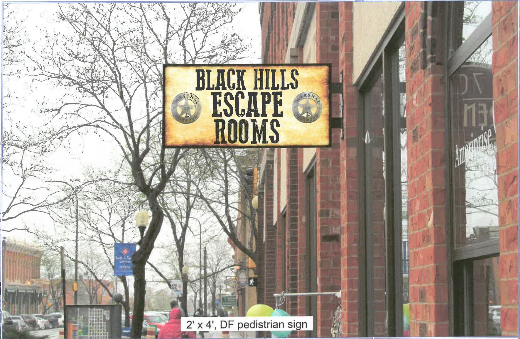
2' x 4', DF pedestrian sign