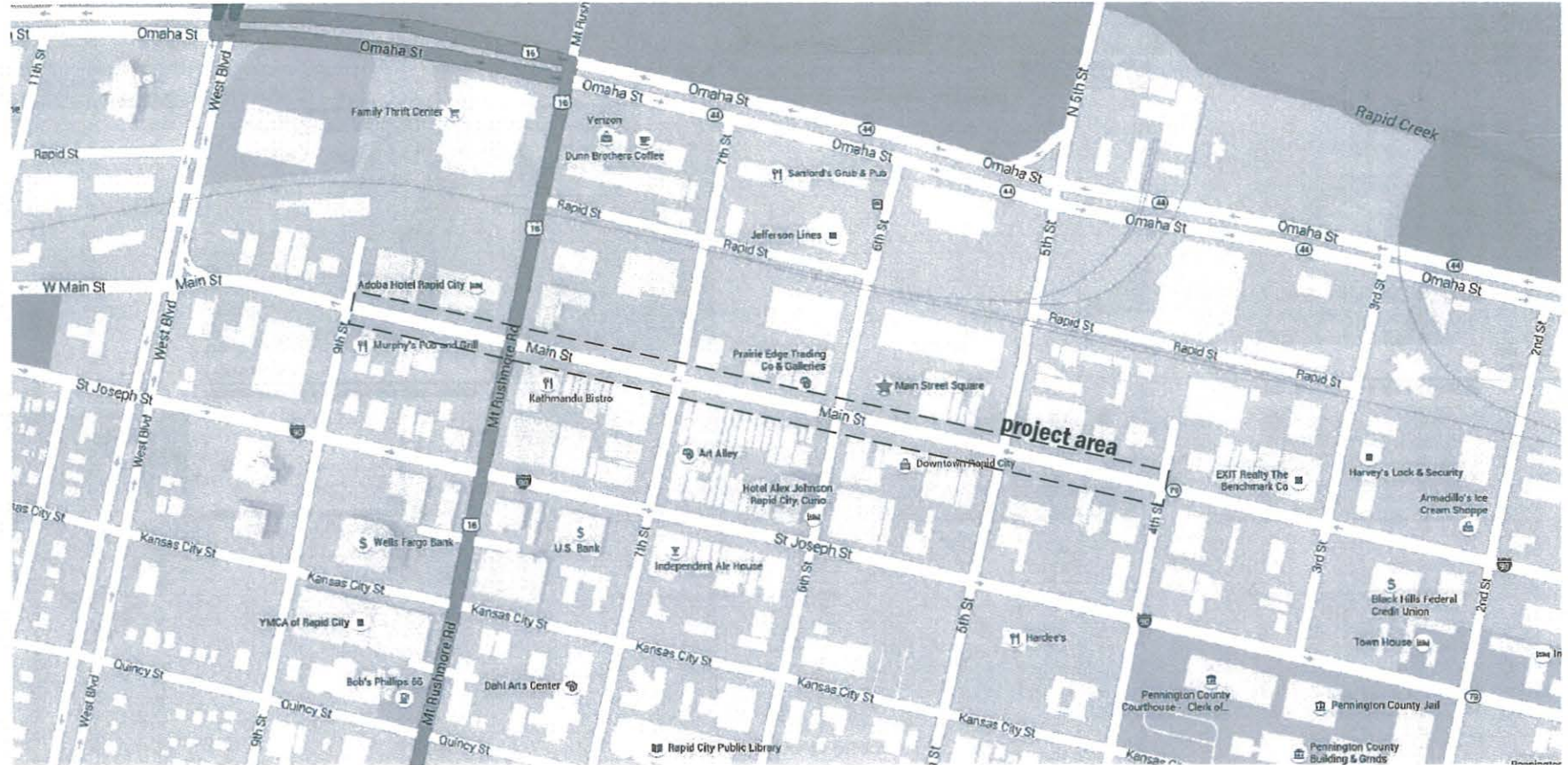
Project Location Map

Main Street from 2nd Street to 9th Street