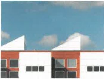
Visual Arts Center Loomis Chaffe Preparatory High School

One Century Tower: Team architect on a new 19 story steel frame high-rise office building and adjacent 6 story parking garage. The Project designer was Cesar Pelli.