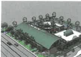
Floral Plaza Chico, California

Rural Health Clinic: This two story outpatient physician and dental facility is part of the Feather River Hospital system, located at the gateway into Paradise, California. Design team responsibility involved building codes, exterior detailing and specifications.