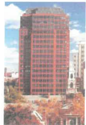
One Century Tower New Haven, Connecticut

Certifications: State of Oregon: • Plans Examiner A-Level • Structural Inspector A-Level • 1 & 2 Family Dwelling Plans Examiner • 1 & 2 Family Dwelling Structural Inspector • Limited Licensed Plan Reviewer and Inspector