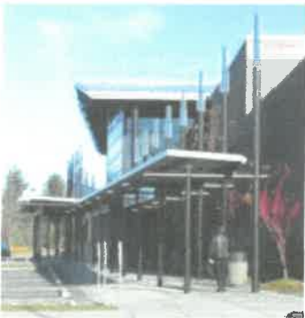
Regal Cinema Portland, Oregon

Projects: Safeway Grocery Store: Project Architect responsible for the contract documents for the new 55,000 SF super store in LaGrande, OR.