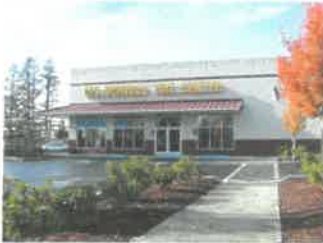
Les Schwab Tire Center Portland, Oregon

Projects: Portland Jewish Academy: Master Plan Amendment: The Portland Jewish Academy (PJA) is a private school for kindergarten through eighth grade students in Portland, Oregon. dka represented the PJA at the City of Portland when they processed their Master Plan Amendment and related Street Vacation submission.