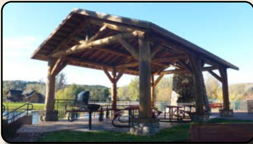
Canyon Lake Chimney Shelter #4 4515 Jackson Blvd.