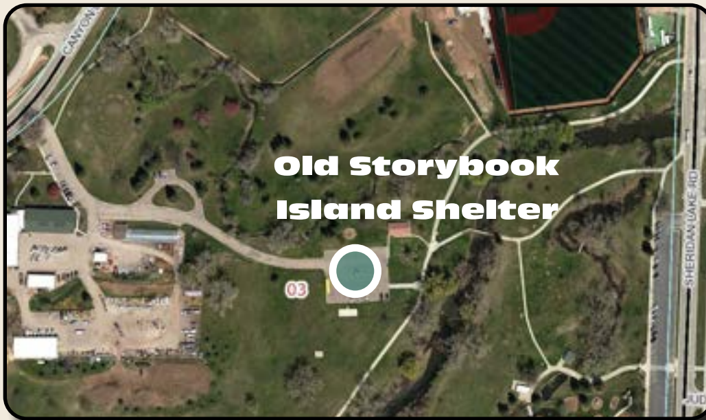
Old Storybook Island Shelter 2911 Canyon Lake Drive