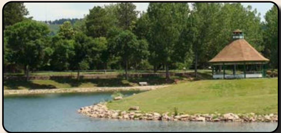
Canyon Lake Gazebo #5 4211 Beach Drive Small Wedding Venue