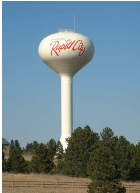
S. Hwy 16 Water Tower