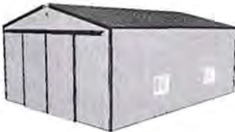
Endwall 1 &amp; Sidewall 2

Location: N/A Tenant: N/A 4849 ENCHANTED PINES DR RAPID CITY, SOUTH DAKOTA 57701 County: PENNINGTON