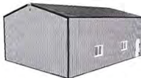
Endwall 2 &amp; Sidewall 1